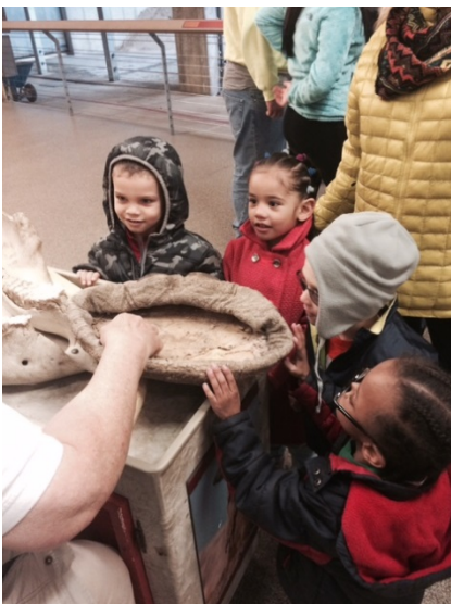
Preschoolers touch elephant display

CSC's preschoolers enjoyed a field trip to Cleveland Metroparks Zoo on Wednesday, May 20 th .