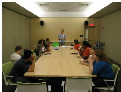
Group instruction – job seeking skills training

*Skills leading to successful employment: communication, attendance, punctuality, initiative