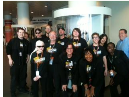
Rock n' Roll Hall work group