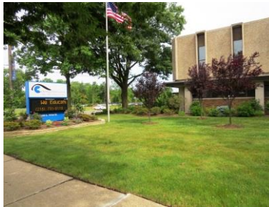
Cleveland Sight Center

June 9 Registration , orientation & move in