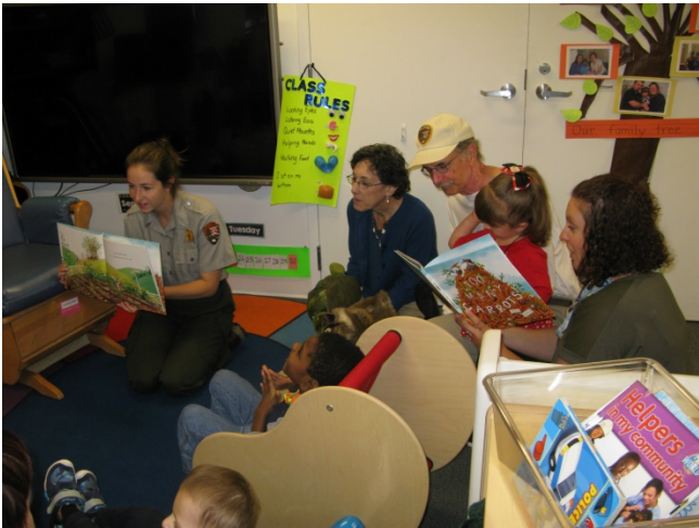
Rangers and volunteers read books to students