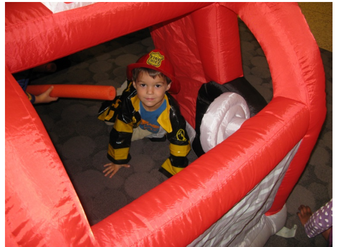
A preschooler in his fireman hat and jacket