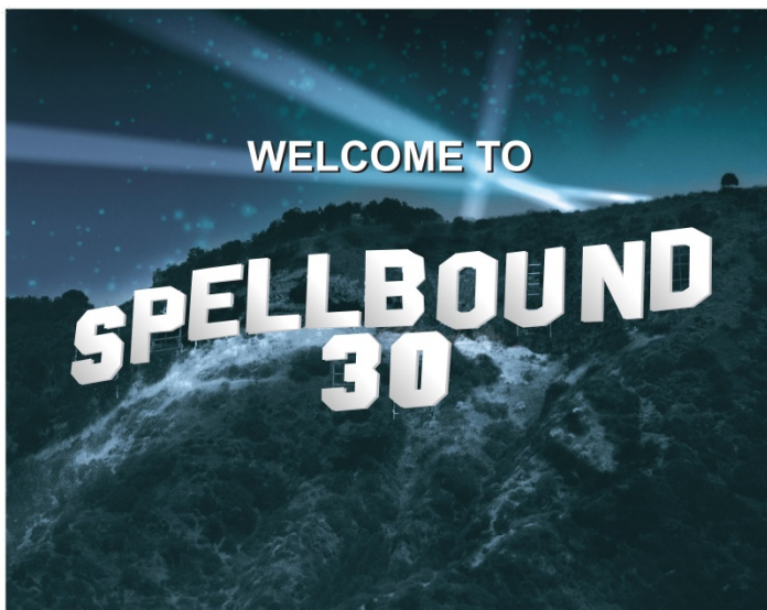
“Welcome to Spellbound 30” sign resembling the Hollywood letters sign