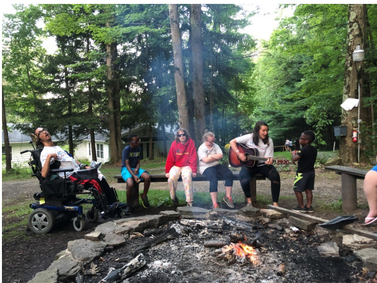
Campers around the campfire singing songs and listening to the guitar

-To celebrate the end of the camp season, Highbrook Lodge hosts the End-of-Summer BBQ this weekend on Sunday, August 11 th from 12:00 p.m. to 3:00 p.m. During this special event, Highbrook Lodge will provide delicious picnic foods, activities for ‘campers’ of all ages (including swimming), and an amazing atmosphere with incredible company.