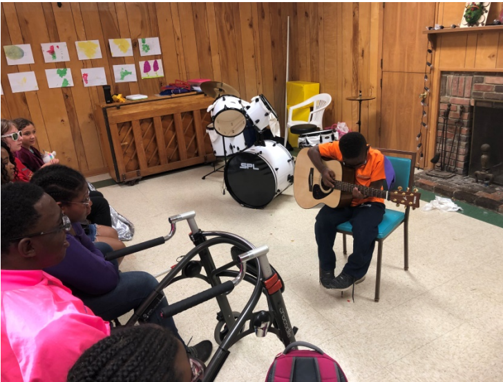
A camper performs on his guitar for the group

was the perfect group to have as another camp season ends. The camp magic is in full force!