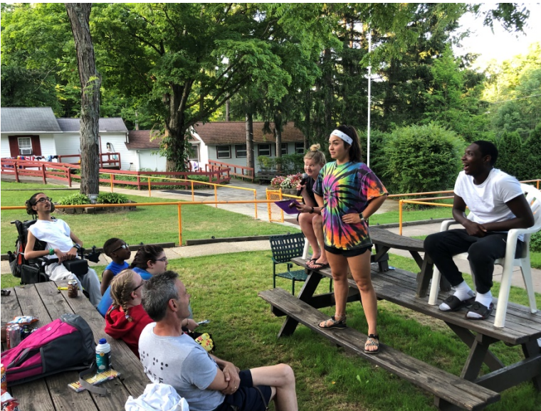
"Night Court" evening program where camp counselors were put on trial for different crimes