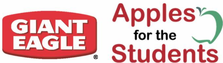
Giant Eagle logo and Apples for the Students logo