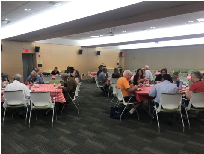
Staff enjoying lunch in the Clyde E. Williams, Jr. Auditorium