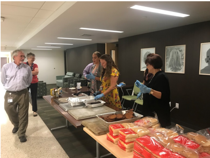
Staff volunteers ready to serve