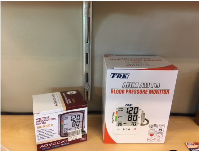
Image of two blood pressure monitors