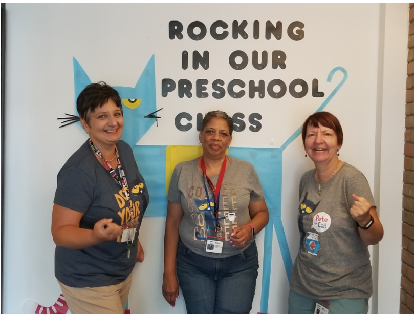
Preschool teachers ready for the school year