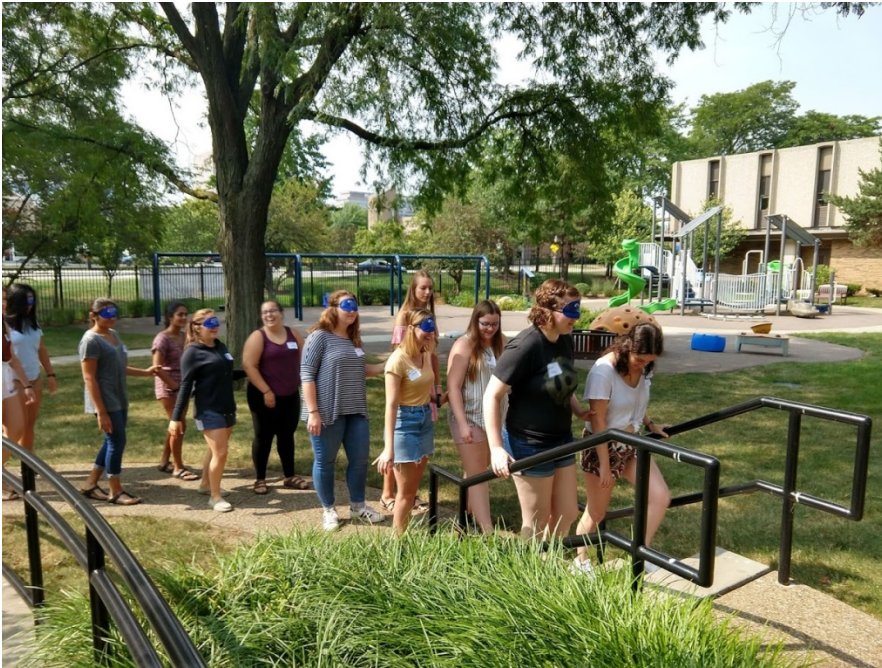
Delta Gammas practice sighted guide in the Empowerment Park

Delta Gammas in front of the CSC front yard sign