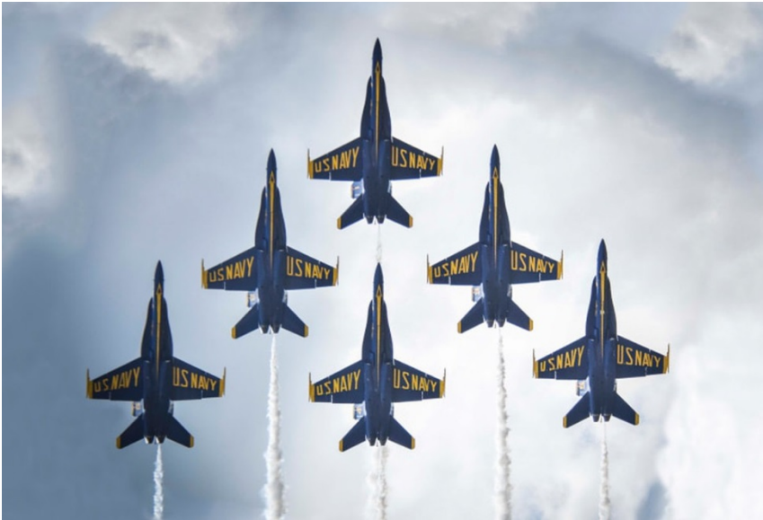
U.S. Navy Blue Angels in the six-jet Delta Formation