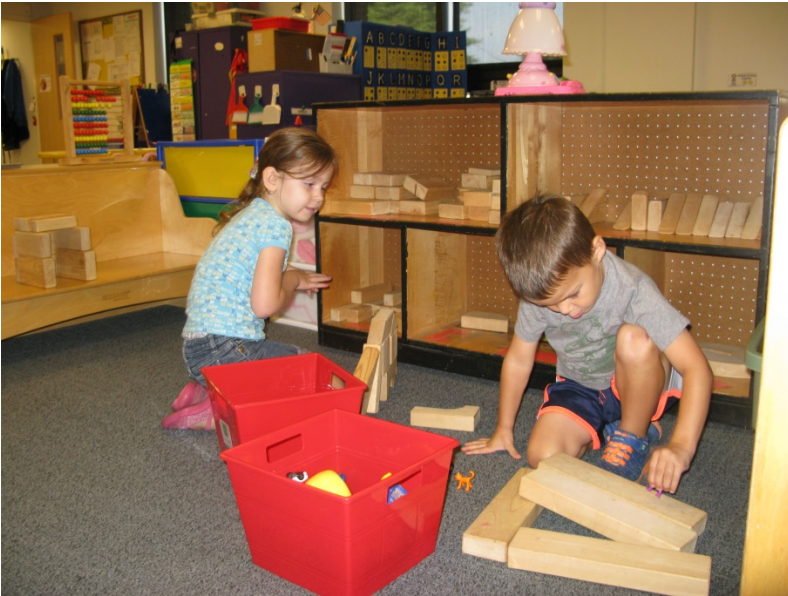
Preschoolers building with blocks