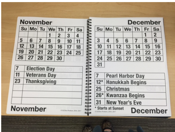
Month pages of the planner