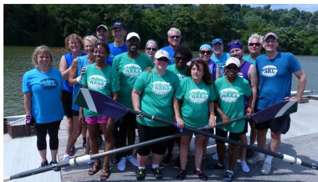
Team VIPERs with volunteers from WRRRA