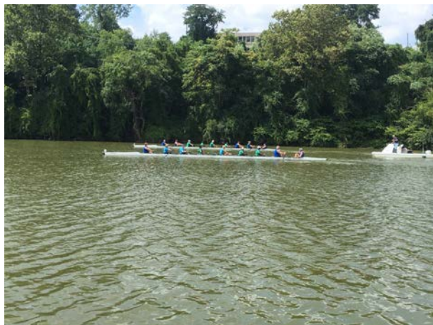
Team VIPERs boats on the river