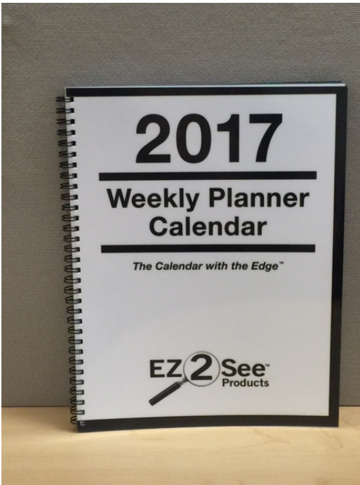
Front cover of the planner with coil binding