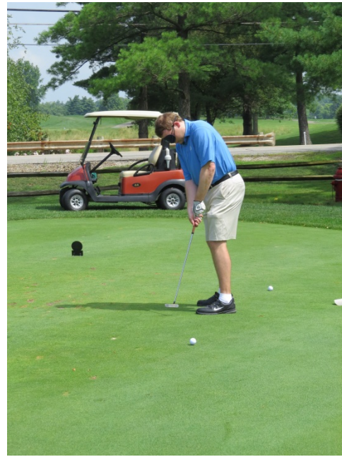
A golfer attempts a putt under blindfold