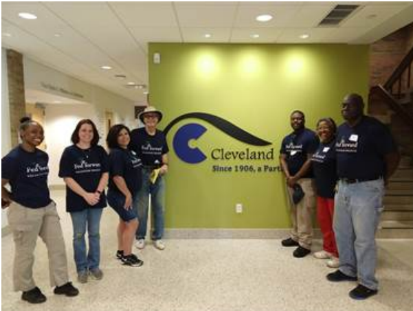
Group photo of Federal Reserve Bank volunteers