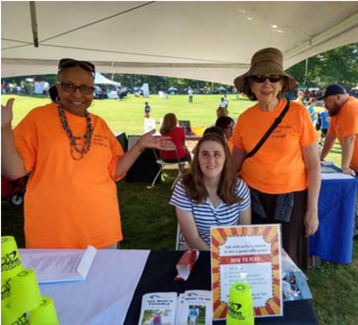
CSC ADA Day Volunteers