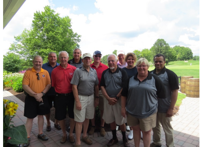
Group photo of Board Trustees