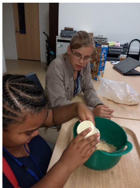
Career Exploration participants practice their baking skills