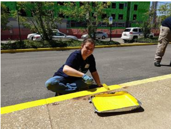
Volunteers paint the curbs in front of CSC's building