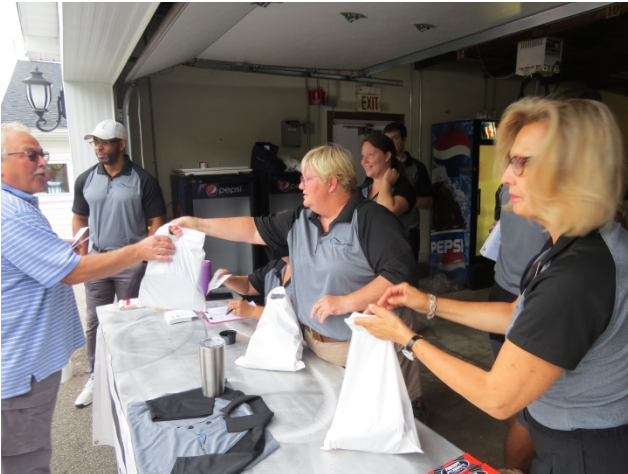
Golfer at registration gets his gift bag