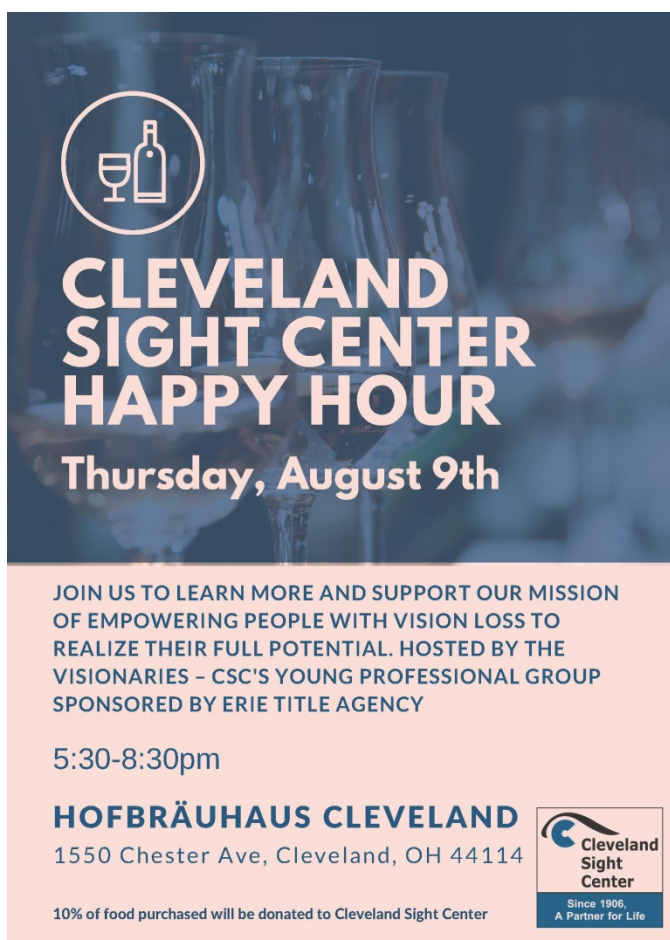
Image of the event invitation for Visionaries Happy Hour