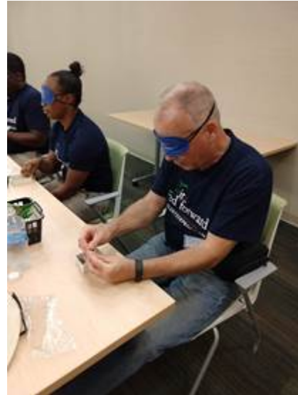
Volunteer counts change while blindfolded