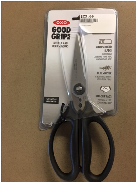
Image of Good Grips kitchen shears

plastic wrapping, meats, vegetables and more. These shears also have an herb stripper to remove stems from herbs. The price is $23.00.