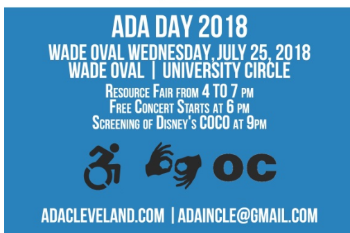
Image of ADA Cleveland flyer