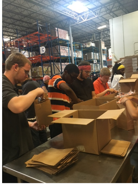
SYWE participants pack boxes of food at the Greater Cleveland Food Bank