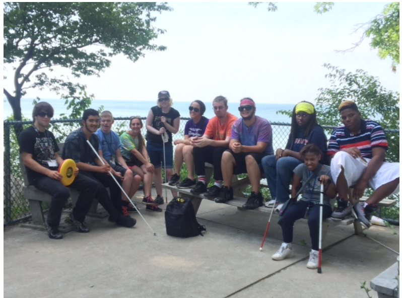
Group photo on a patio overlooking Lake Erie