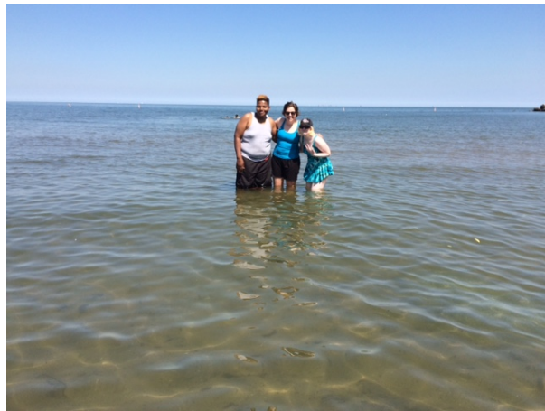
Group photo in front of Food Bank large forks SYWE participants waded in Lake Erie