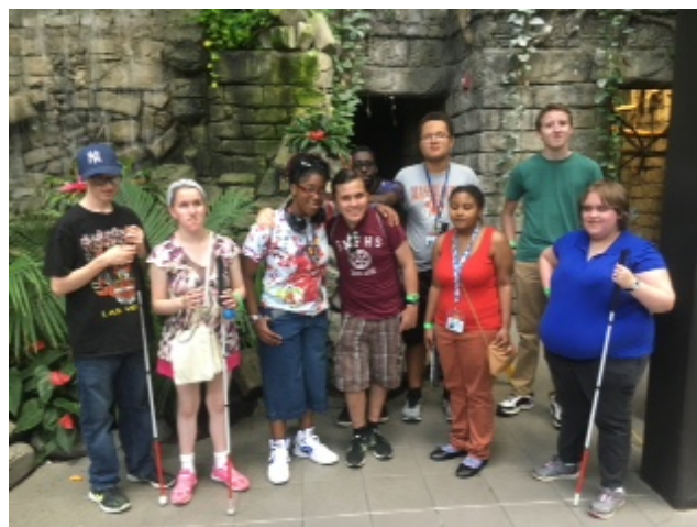
Program participants at the waterfall inside the zoo's rainforest