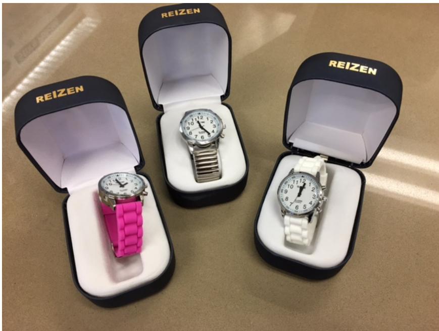
The Talking Tap Watch in pink, chrome and white bands