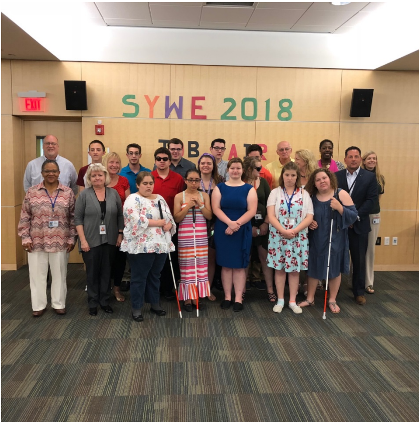
Group photo of interviewers and interviewees at the Job Fair