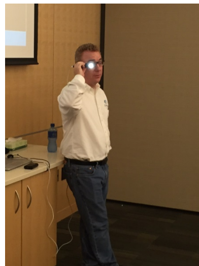
Presenter shows the flashlight feature