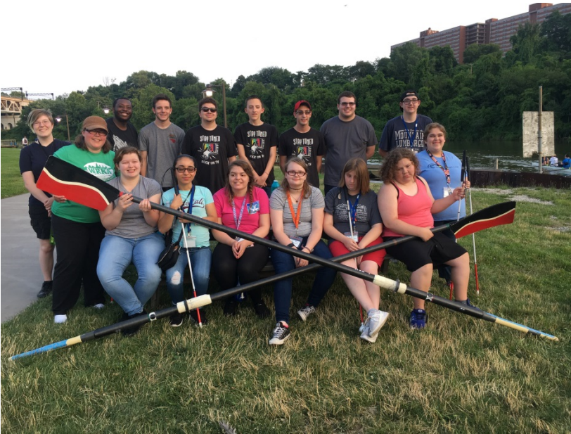
Group photo with rowing oars

instruction in the areas of orientation and mobility, computer skills and activities of daily living. The program concluded with a bang, having the opportunity to go rowing with Team VIPER (Visually Impaired Persons Enjoying Rowing) on Wednesday evening, participated in the Job Fair Thursday morning and put on a fantastic Talent Show Thursday afternoon. We are so proud of this crew - the growth that has been witnessed in these young adults in the past five weeks is phenomenal! Thank you to all staff and volunteers who assisted with the program this year.