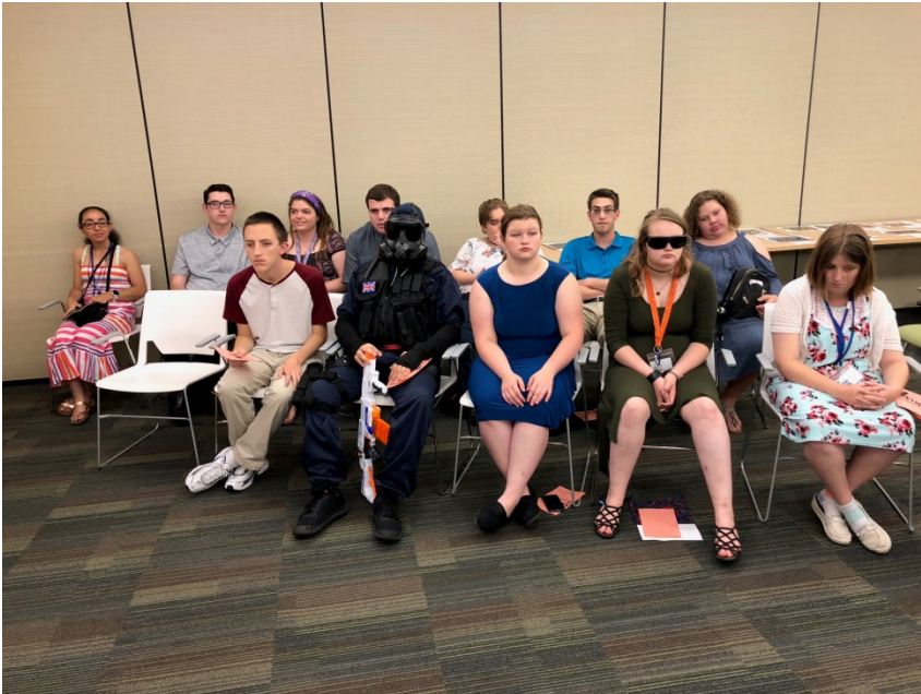
SYWE participants await the start of the Talent Show