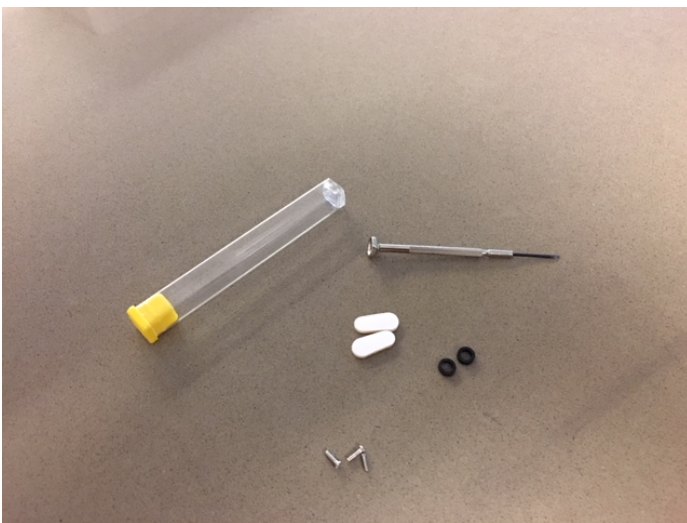
Image of eyeglass repair kit