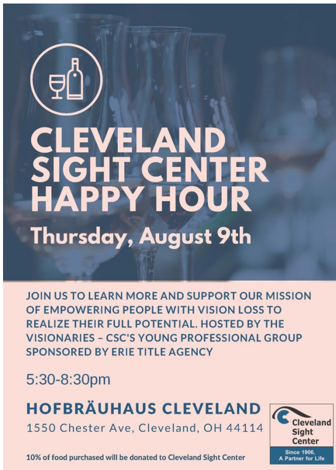
Image of the event invitation for Visionaries Happy Hour