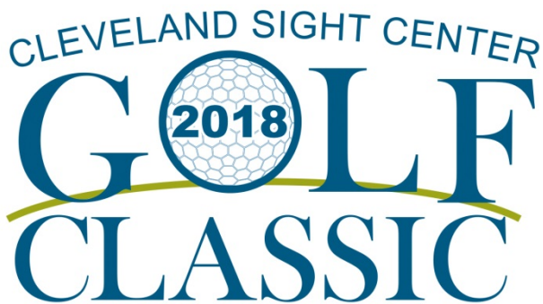
CSC Golf Classic logo