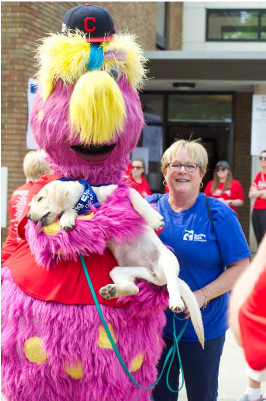
Cleveland Indians mascot Slider holds a puppy in training