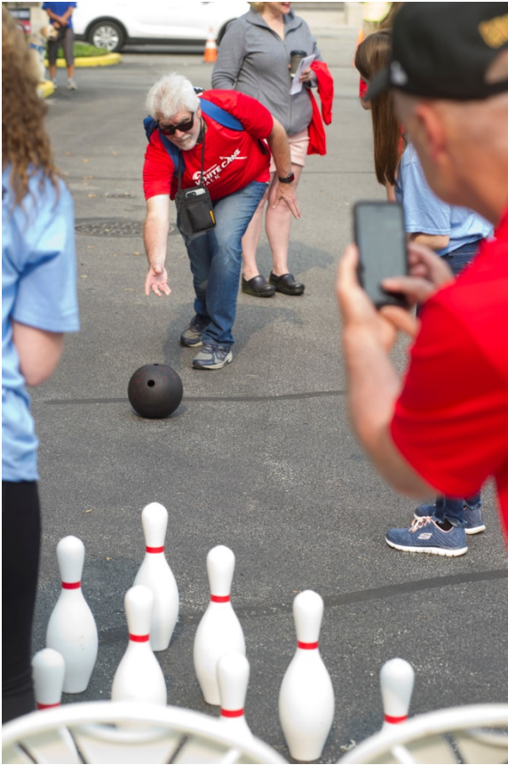
White Cane Walk attendee tries the bowling activity