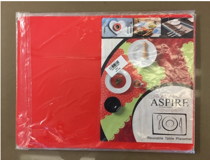
Reusable table placemats in red