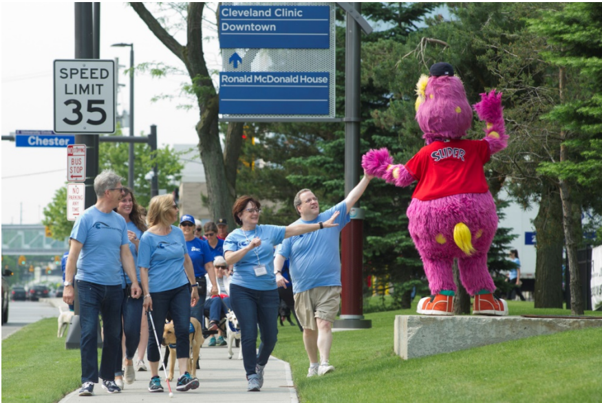
Slider high-fives CSC staff members leading the walk