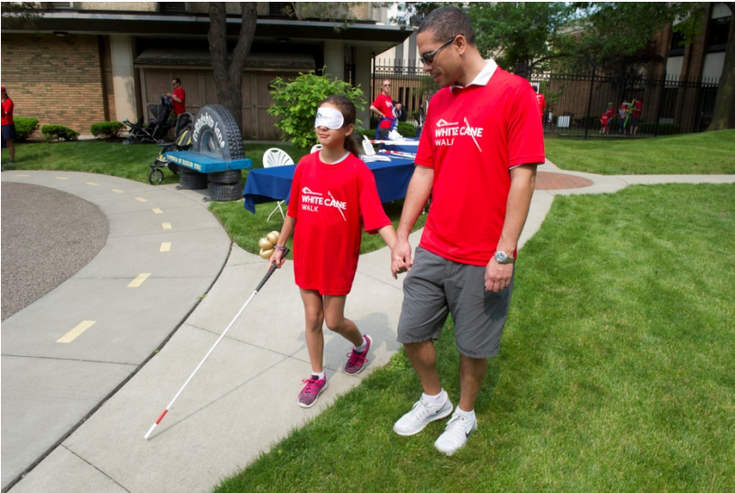
An attendee tries the White Cane Experience under blindfold with the assistance of a sighted guide partner