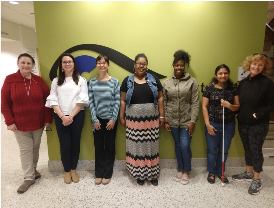
Group photo of new CSC volunteers