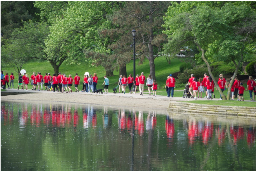
A long line of walkers in red t-shirts along the pathway next to the lagoon with reflection in the water