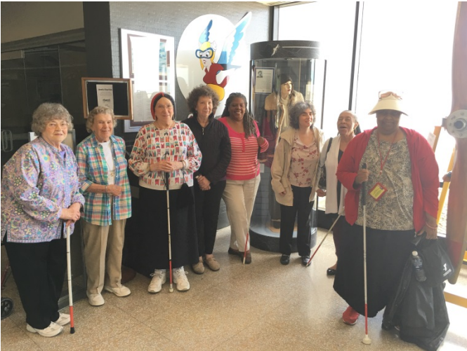
Members of Book Discussion group inside Burke Lakefront Airport