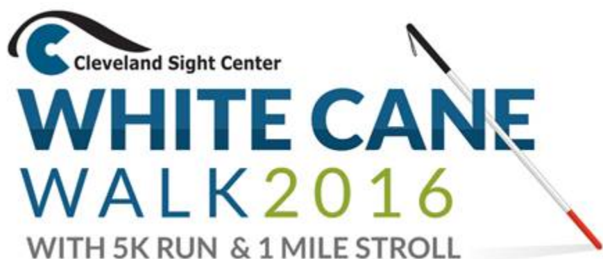
White Cane Walk event logo

activities, live music, games, and a raffle! Bring your family and friends, tell everyone you know!