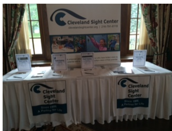
Images of the auction tables with CSC signage