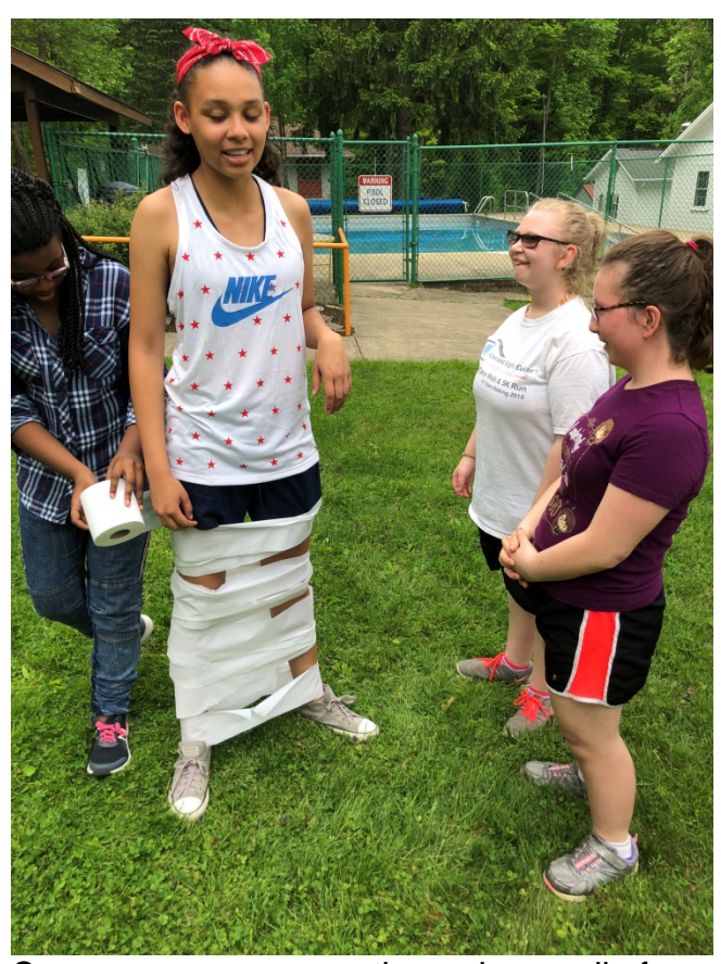
Campers wrap one another using a roll of paper

-Register for camp at Highbrook Lodge this summer! Campers love to get creative and make music, dance and sing! We welcome campers of all ages who have low vision or blindness - click <u>here</u> to register or for more info or call Jenny at 216-658-4596.