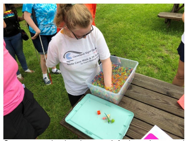
Camper uses her hand to search for items in a container of small beads