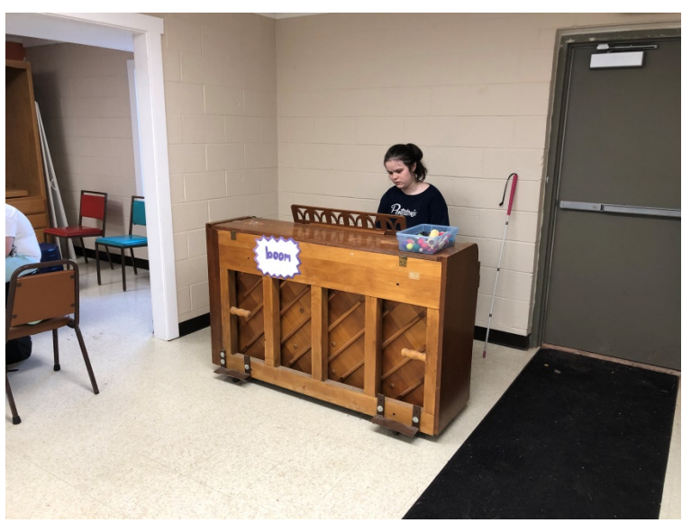
Camper plays the piano

packed into one fun-filled day to learn more about Highbrook Lodge and get back into the summer camp season!