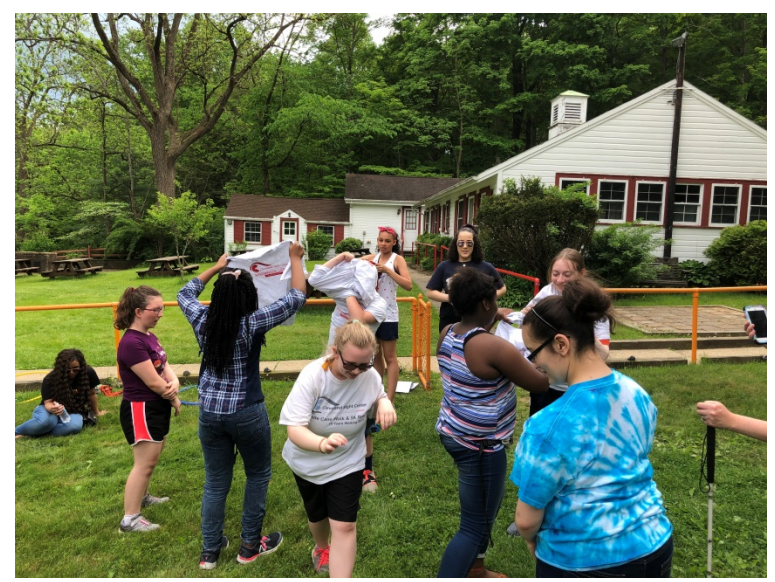
Campers enjoy an activity on the lawn at Highbrook Lodge