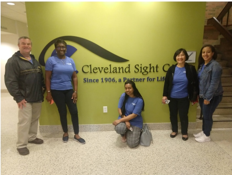
Omnova Solutions volunteers in front of the CSC front lobby sign

-Volunteers from Omnova Solutions spent time at CSC this week helping assemble a “braille by sight” activity for the upcoming Parade the Circle extravaganza on Saturday, June 8 th . A shout out to volunteers who supported to help prepare for this exciting community event!