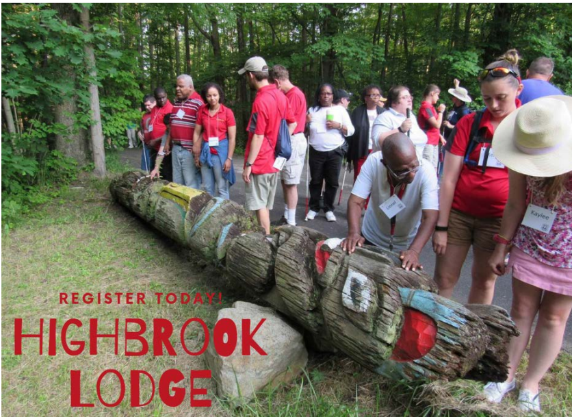
Campers and staff exploring a wooden totem carving while on a hike in the forest. Text says 'Register Today! Highbrook Lodge'

-The Braille Notes Choir performed at Abington Arms Apartments on Wednesday evening as the group sang over 10 songs and captured the audience with soulful performances. Truly a treat for everyone involved.