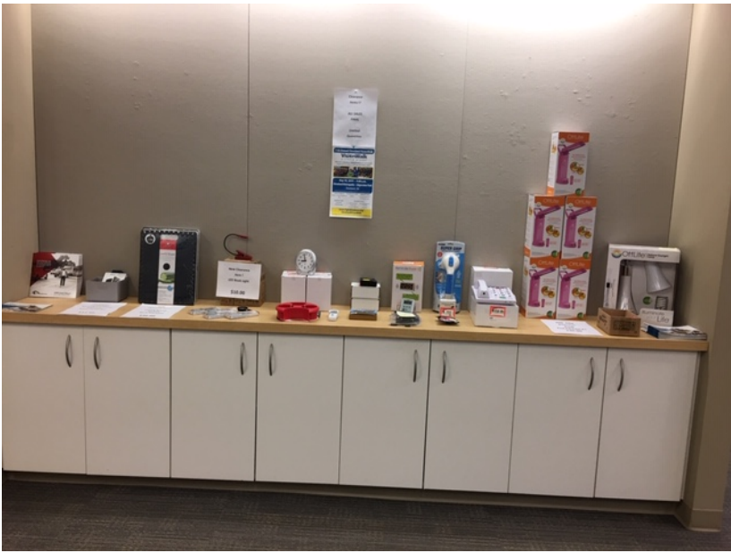
Clearance items on sale in the Eyedea Shop