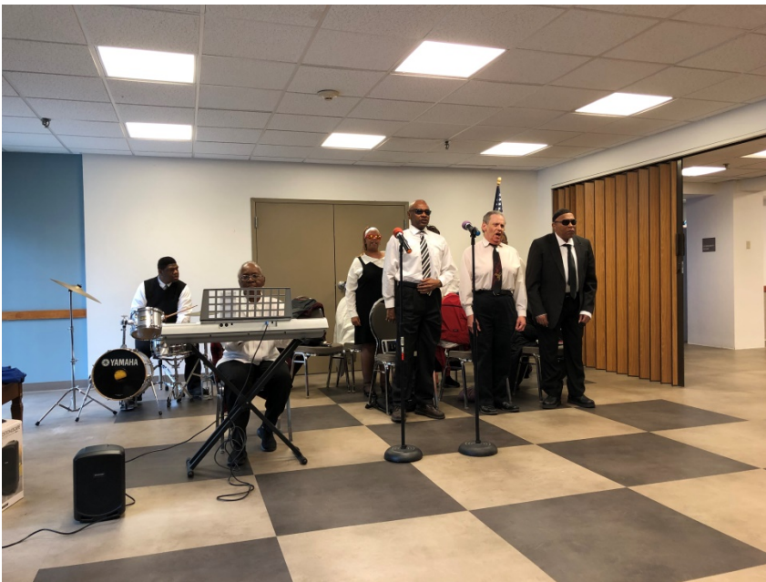
The Braille Notes Choir performs

-The Braille Notes Choir performed at Abington Arms Apartments on Wednesday evening as the group sang over 10 songs and captured the audience with soulful performances. Truly a treat for everyone involved.