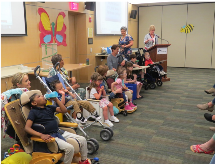
Preschool students lined up for the start of the program