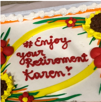
Cake that reads "Enjoy Your Retirement Karen!"

-At Highbrook Lodge, we love to get out and explore! Highbrook Lodge offers summer camp activities for all ages that include wildlife, conservation, camp outs, and of course, hiking! Find more information or to register click here or call Jenny (216-791-8118).