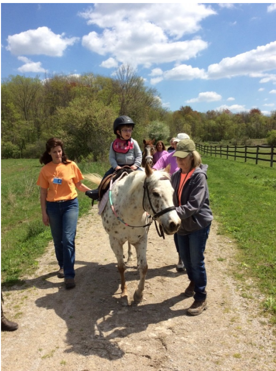
Preschool student enjoys a horseback ride

-Students in Bright Futures Preschool had another very busy week in class! With the weather finally being warmer they have been able to enjoy more time outdoors. Horseback riding lessons are in full swing and students have been able to use the outdoor trail in CSC's Empowerment Park. The class caterpillars are already very big and fat – they should turn into cocoons very soon. And, of course students were very busy preparing for their Mother's Day Celebration – this year they invited their moms for a "Painting with Moms" party!