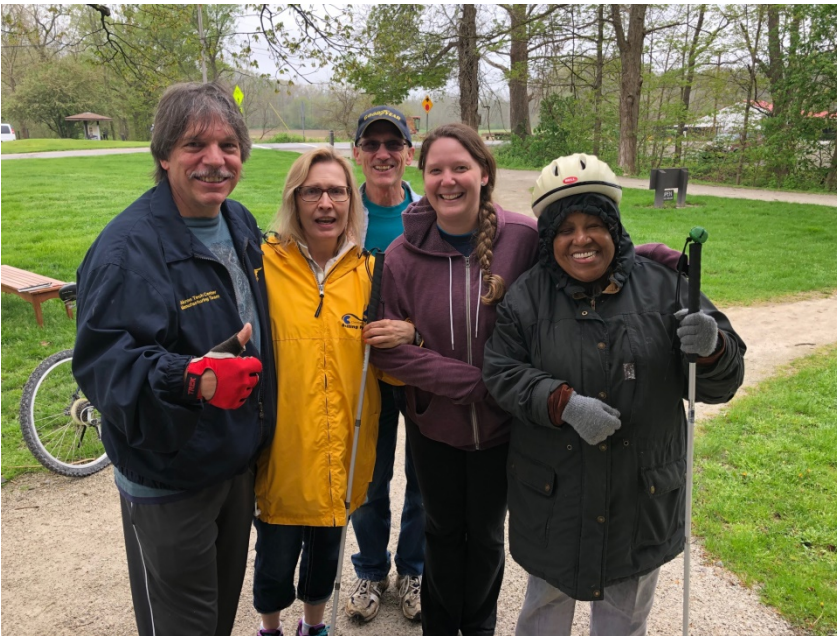
Group photo of volunteers and Bike and Hike participants

-The first golf outing of the season happened on Tuesday, May 7 th . Players headed out with volunteer coaches at North Olmsted and Washington Park golf courses for a great afternoon on the links.