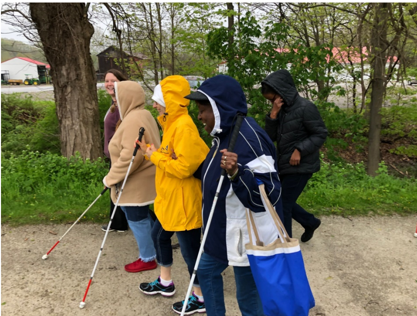
Hikers enjoy a walk along the trail