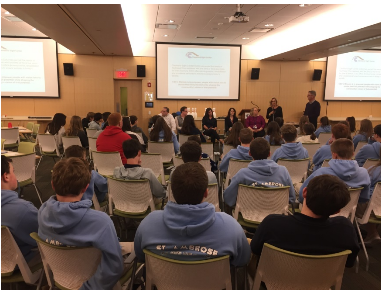
A full Clyde E. Williams, Jr. Auditorium as students listen to the panelists