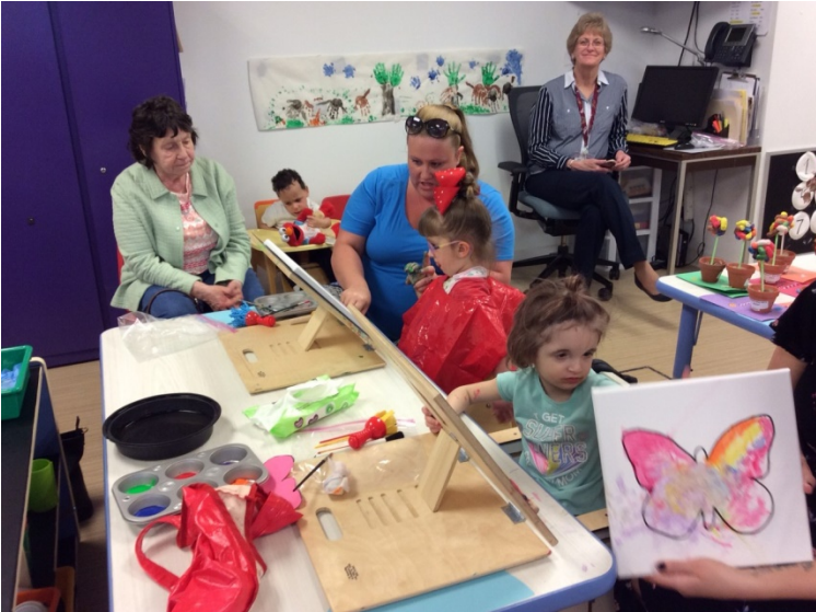
Students and their family members enjoy the painting project

-Bright Futures Preschool graduation will be Thursday, May 23 rd at 10:00 a.m. in the Clyde E. Williams, Jr. Auditorium at CSC.