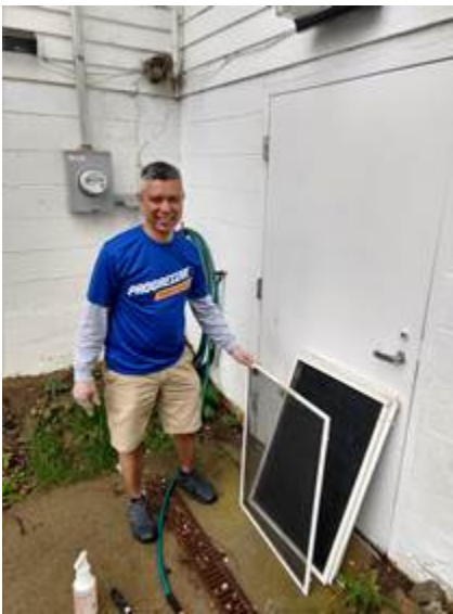
Volunteer cleans window screens

-A group from Progressive's corporate IT department volunteered at Highbrook Lodge on Thursday, May 2 nd helping with various projects including wallpaper removal, painting and cleaning to prepare camp for the coming season. Shout out to the group to thank them for all of their hard work!