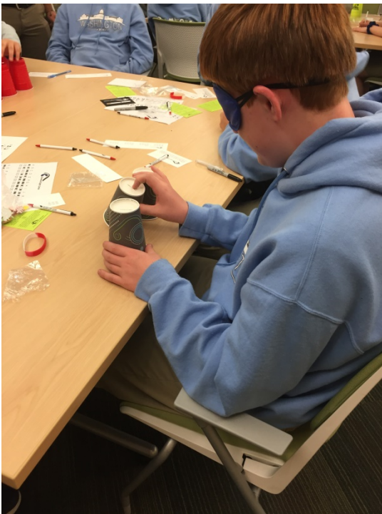
A student stacks cups while blindfolded