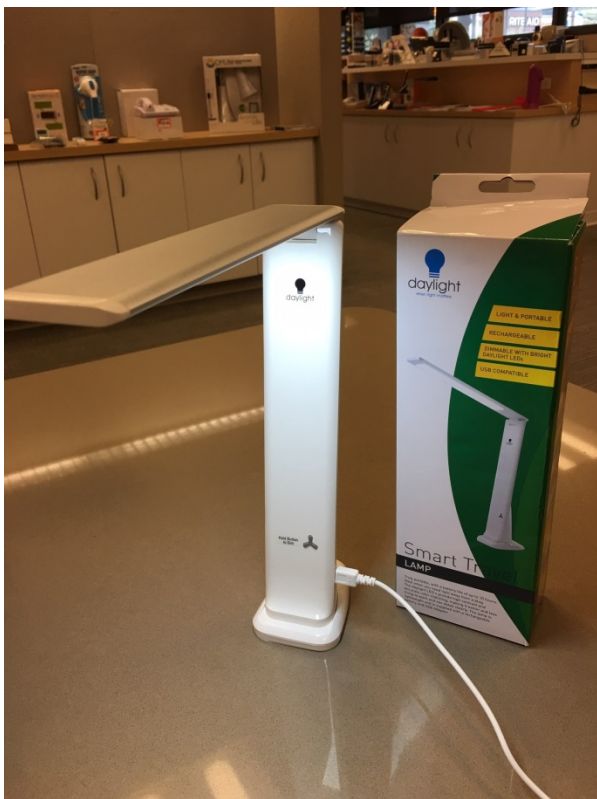
Daylight Portable Rechargeable lamp

-Brighten your day with the Eyedeas Shop's new Daylight Portable Rechargeable Lamp. It is the sister product to their other Daylight LED Lamp made by Uno. It has a slender design and also has a dimming feature. It charges with a USB connection or plug into a charging cube. The price is $48.00...so put some light on the subject, either book or project, with the new Uno lamp.