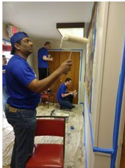
Volunteers freshening up camp with paint

-Highbrook Lodge also hosted a volunteer group from the Federal Reserve Bank of Cleveland on Wednesday, May 8 th . The group rolled up their sleeves to help prime Palda Cabin in preparation for the coming season. CSC is thankful to have this group and others to help make camp a welcoming space for campers!