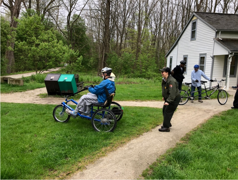
Tandem bikers start to pedal with encouragement from the Park Ranger

Hikers walk along the towpath trail in the Cuyahoga Valley National Park