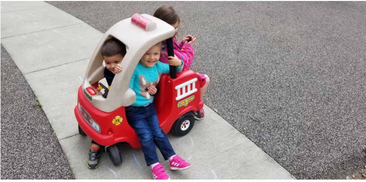
Three students in one play car as they enjoy the Empowerment Park trail