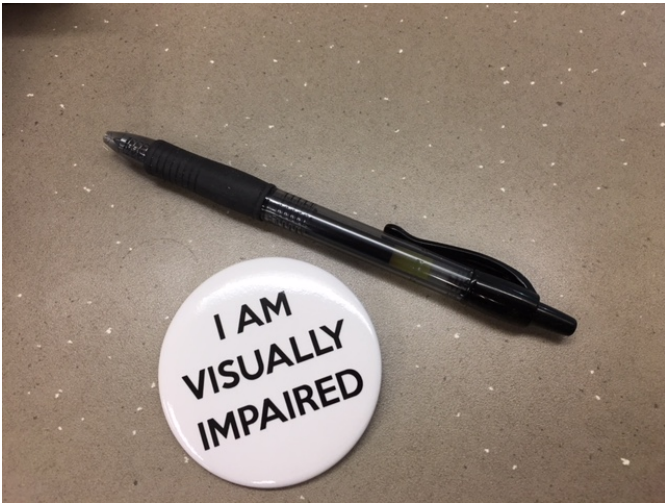
White button with black text "I AM VISUALLY IMPAIRED"

airports, while shopping or running errands, or just when riding public transportation. The price is $1.00.