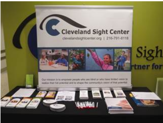
CSC's information table sporting a new tabletop banner and agency collateral