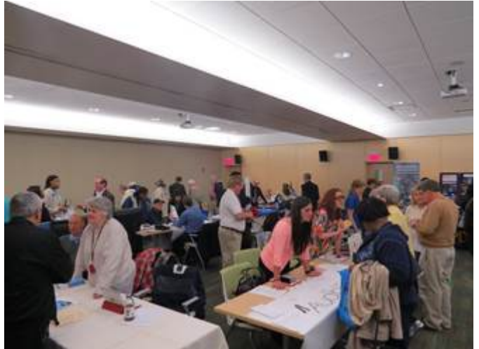
A full Clyde E. Williams, Jr. Auditorium with vendors and attendees