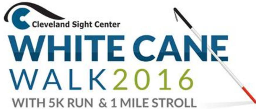
White Cane Walk event logo