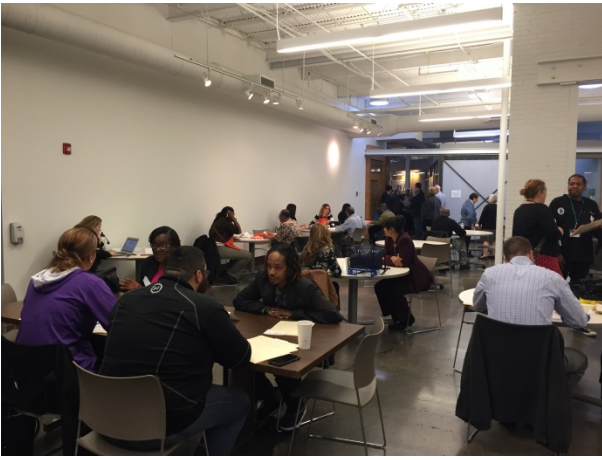
ECCC hiring event attendees in interviews