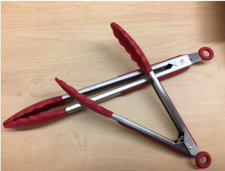
Silicone tong set