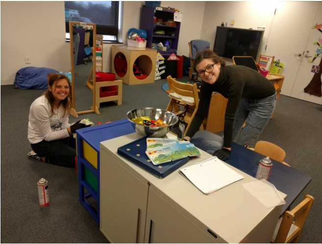
Delta Gammas cleaning toys and cabinets in the preschool