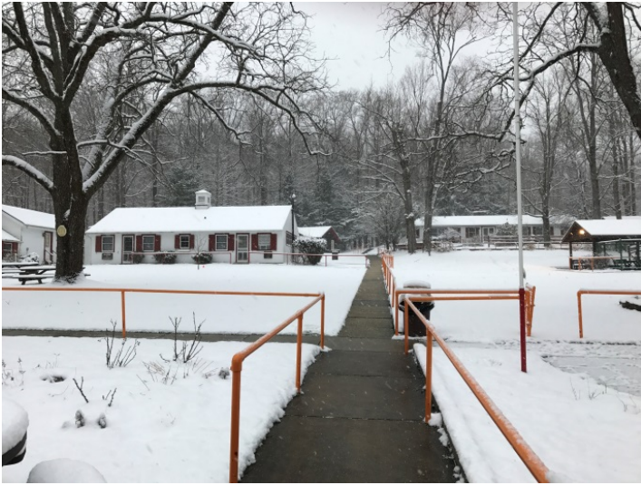
The grounds of Highbrook Lodge covered in snow