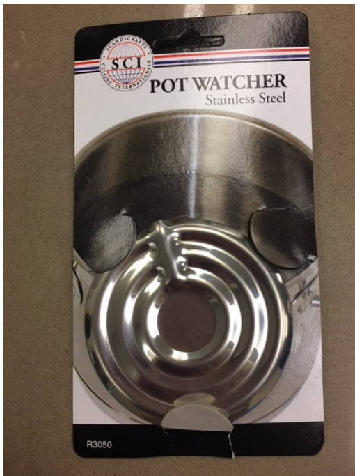
Image of the Pot Watcher