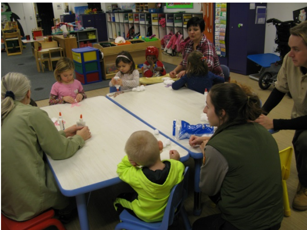
Students, teachers and rangers work on a craft