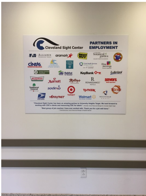
Partners in Employment sign

Also, the CSC logo and agency information boards have been added to walls in the Low Vision Clinic to promote the CSC brand and other areas of the agency to patients and caregivers in the waiting room.