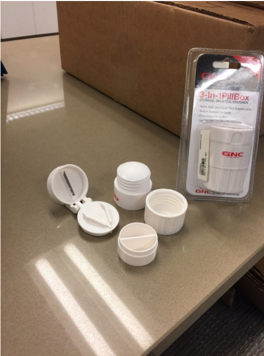
GNC's 3-In-1 PillBox