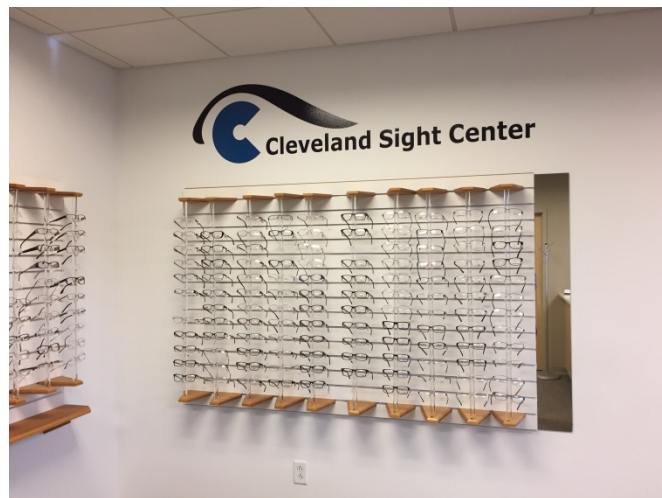
CSC logo above the frame racks