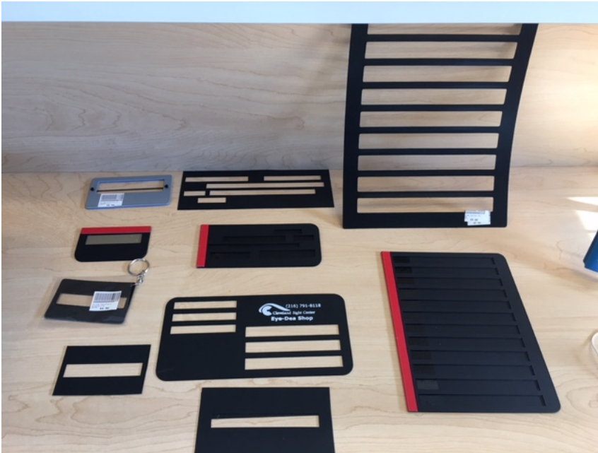
All kinds of writing guides