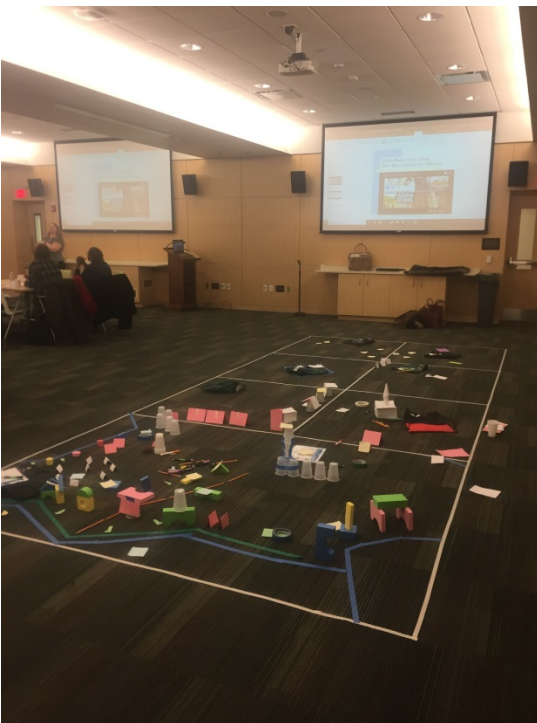
Set up of a poverty simulation activity titled "Archie Bunker's Neighborhood"