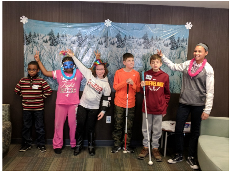
Group photo of the "tween" BLAST participants