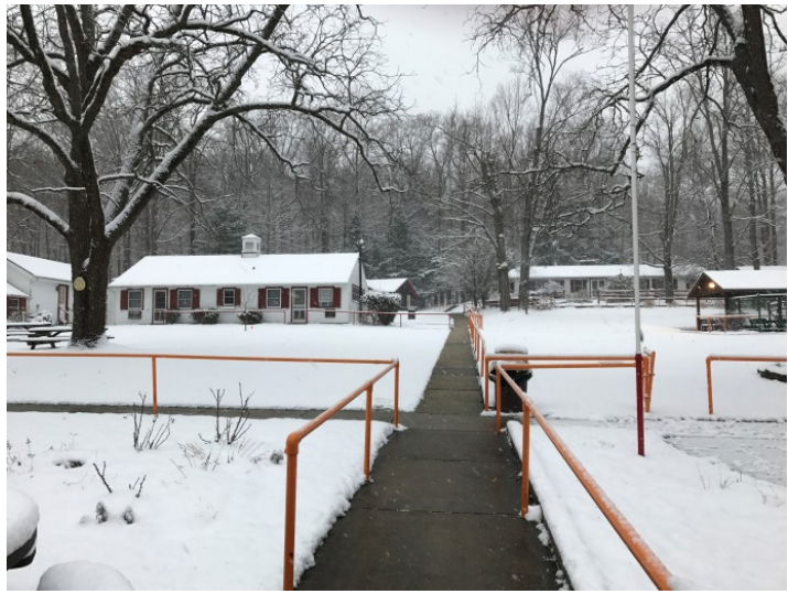
The grounds of Highbrook Lodge covered in snow

weekend is $65/camper. Transportation to/from CSC is provided for an additional $15/camper. To register please call the Camp Department (x4596 or x4597).