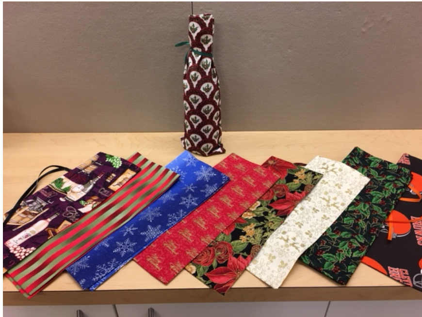
Various patterns and prints on wine bottle bags