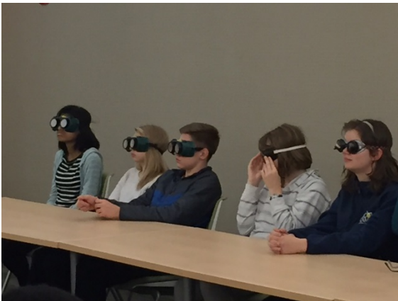
Students wearing vision simulation glasses