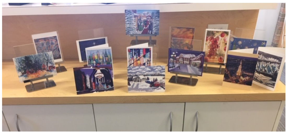
Assorted Holiday Cards on display in the Eyedea Shop

Holiday Cards are here and available for viewing in the Eyedea Shop. Price per card is a $1.00 and some of the cards from past years are now half price. Come check out the selections and pick your favorites.