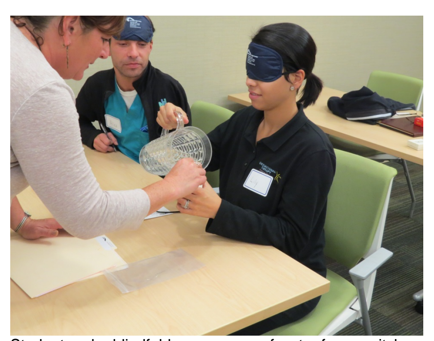
Student under blindfold pours a cup of water from a pitcher using a liquid level indicator

CSC partnered with the Cleveland Museum of Art, Community Center for the Deaf & Hard of Hearing, Cuyahoga County Board of Developmental Disabilities, Northeast Ohio DeafBlind Association and Opportunities for Ohioans with Disabilities for "A New Sensory Experience" tactile carnival being held at the Cleveland Museum of Art last weekend. Hundreds of attendees were exposed to CSC's