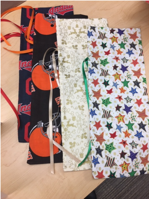
Variety of wine/gift bags