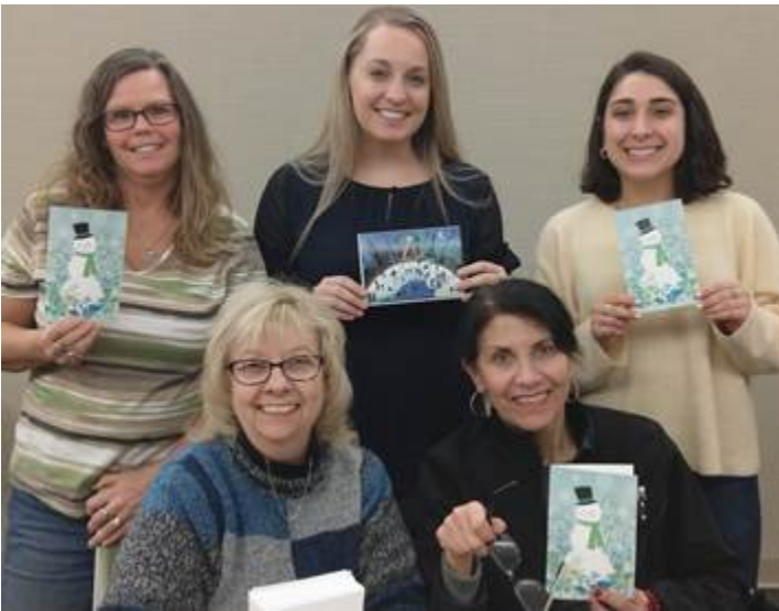
Volunteers smile and hold their #GivingTuesday greeting cards