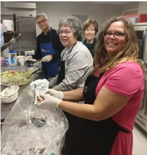
Winners Club volunteers smile during salad preparation