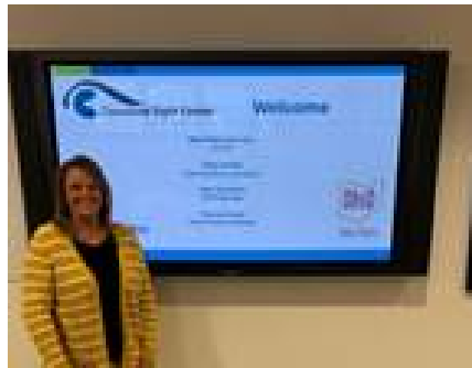
Visitors from TourismOhio get their pictures taken in front of the lobby welcome monitor