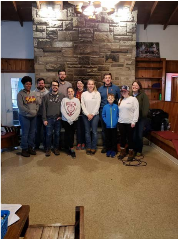
Group photo of the Visionaries in front of the fireplace at Highbrook Lodge