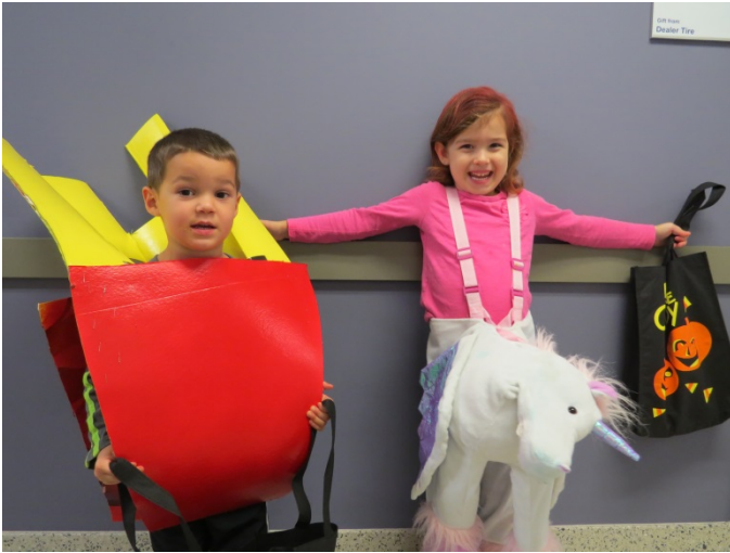
Student dressed as a french fry box and another riding a unicorn