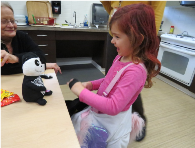
Student enjoys the tabletop singing panda bear