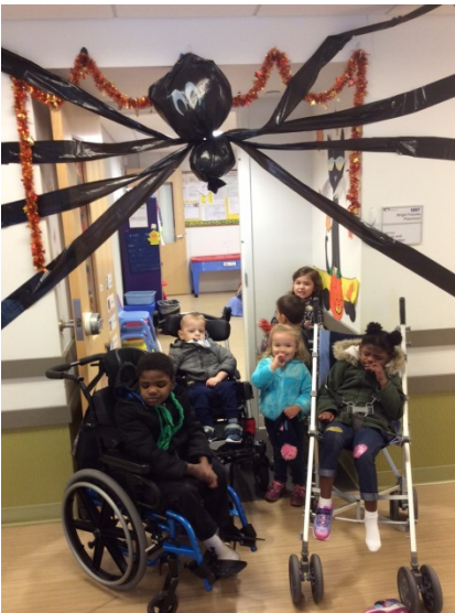
Students under their large spider craft hanging in the classroom doorway