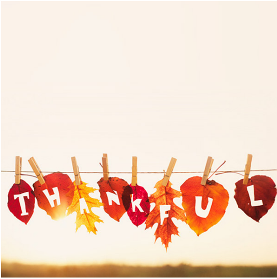
Fall leaves on a clothesline with the letters of "Thankful" on each leaf