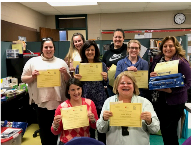
Group photo of participants displaying their certificates