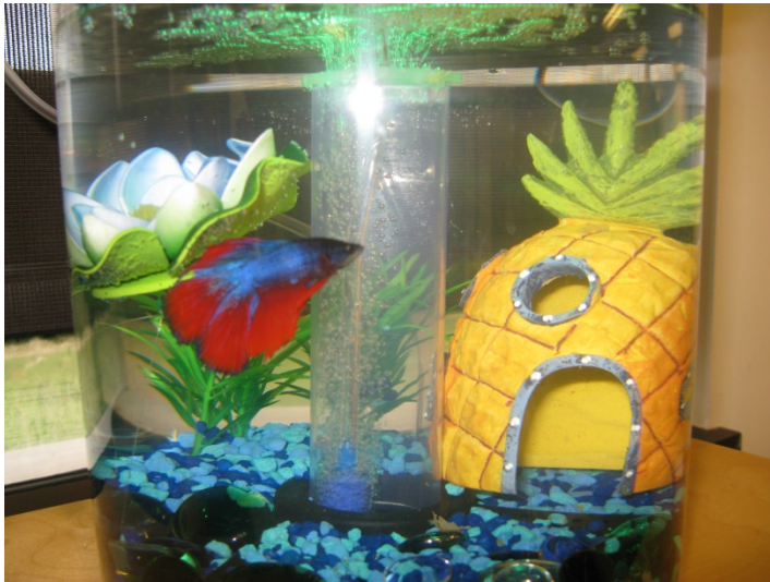
Swimmy the betta fish in his fish tank