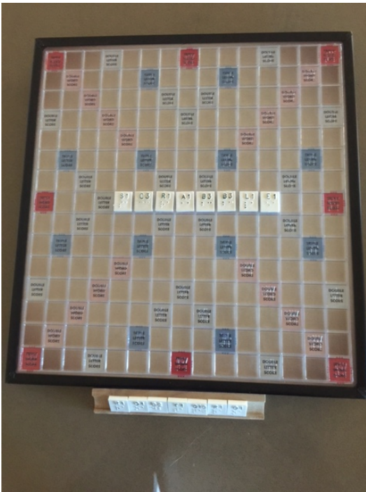
Braille Scrabble game board