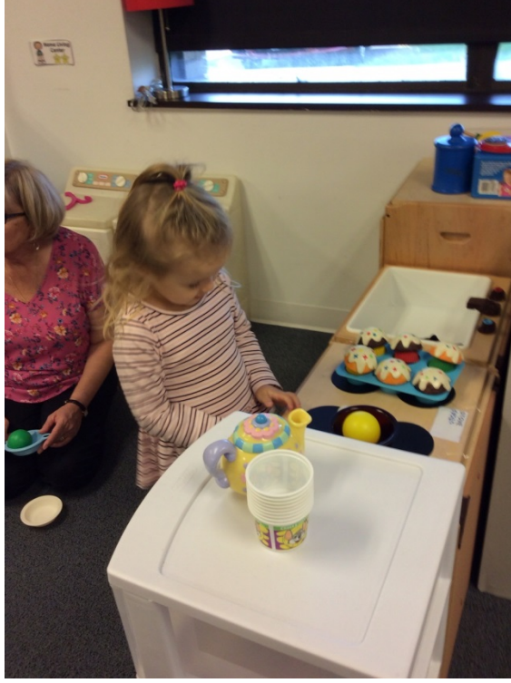
Preschool practices "cooking" with apples

• The United States Association of Blind Athletics (USABA) is hosting its annual National Fitness Challenge! Participants with vision loss across the country are teaming up to get fit! Each participating city receives 25