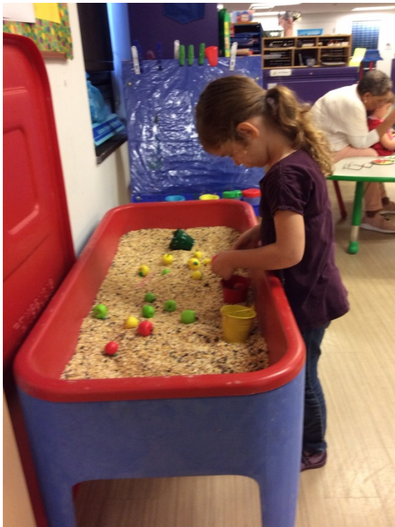
Preschooler sorts red, green and yellow apples