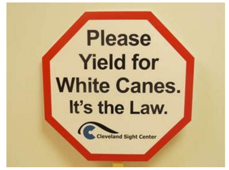
Sign that reads "Please Yield for White Canes. It's the Law."

White Cane Safety Day is Monday, October 15<sup>th</sup>. The white cane is an important orientation, navigation and safety tool used by those who are blind or have low vision. The National Federation of the Blind assembled in 1963 and called upon governors of all 50 states to proclaim October 15<sup>th</sup> of each year in every state as white cane day. Then, on October 6<sup>th</sup>, 1964, a joint resolution of Congress (HR 753) was signed into law authorizing the President of the United States to proclaim October 15<sup>th</sup> of each year as "White Cane Safety Day". Within hours of the passage of this congressional joint resolution, then President Lyndon B. Johnson recognized the importance of the white cane. For more information on this important date, <u>click here</u>.