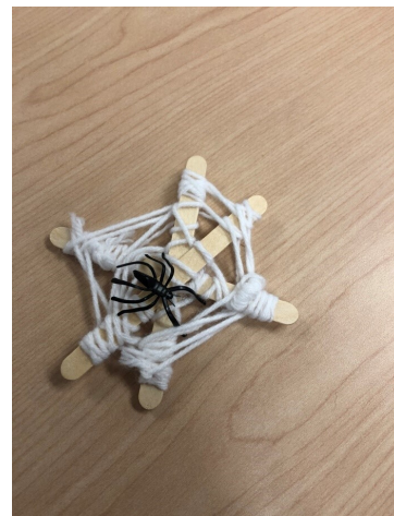
A completed spider web craft made of white yarn, wooden sticks and a black plastic spider