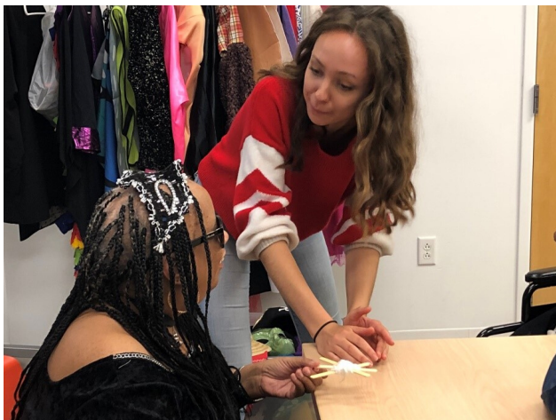
A volunteer gives direction as an attendee makes a spider web craft

-CSC hosted a spooky, fun-filled Halloween party for clients at the agency on Tuesday, October 29th including lunch in the Clyde E. Williams, Jr. Auditorium, a Halloween craft activity, dance party, face-painting and a costume contest!