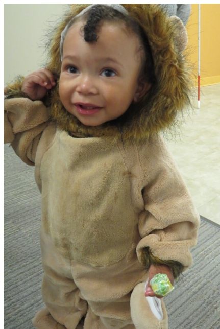
A toddler in a lion costume

-The students and staff of Bright Futures Preschool also visited the Cleveland VA Hospital this week to interact with the patients and collect some Trick-or-Treat goodies. This was the first time for such an intergenerational activity - but very successful and sure to be repeated!