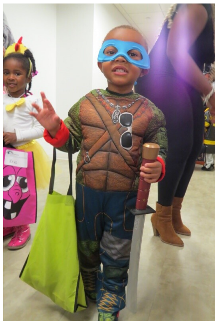
Preschooler in costume as a Teenage Mutant Ninja Turtle

-Students in CSC's Bright Futures Preschool enjoyed their annual Trick-or-Treat Parade on Thursday. Thanks to CSC staff members for providing the treats and a fun experience for the preschoolers.