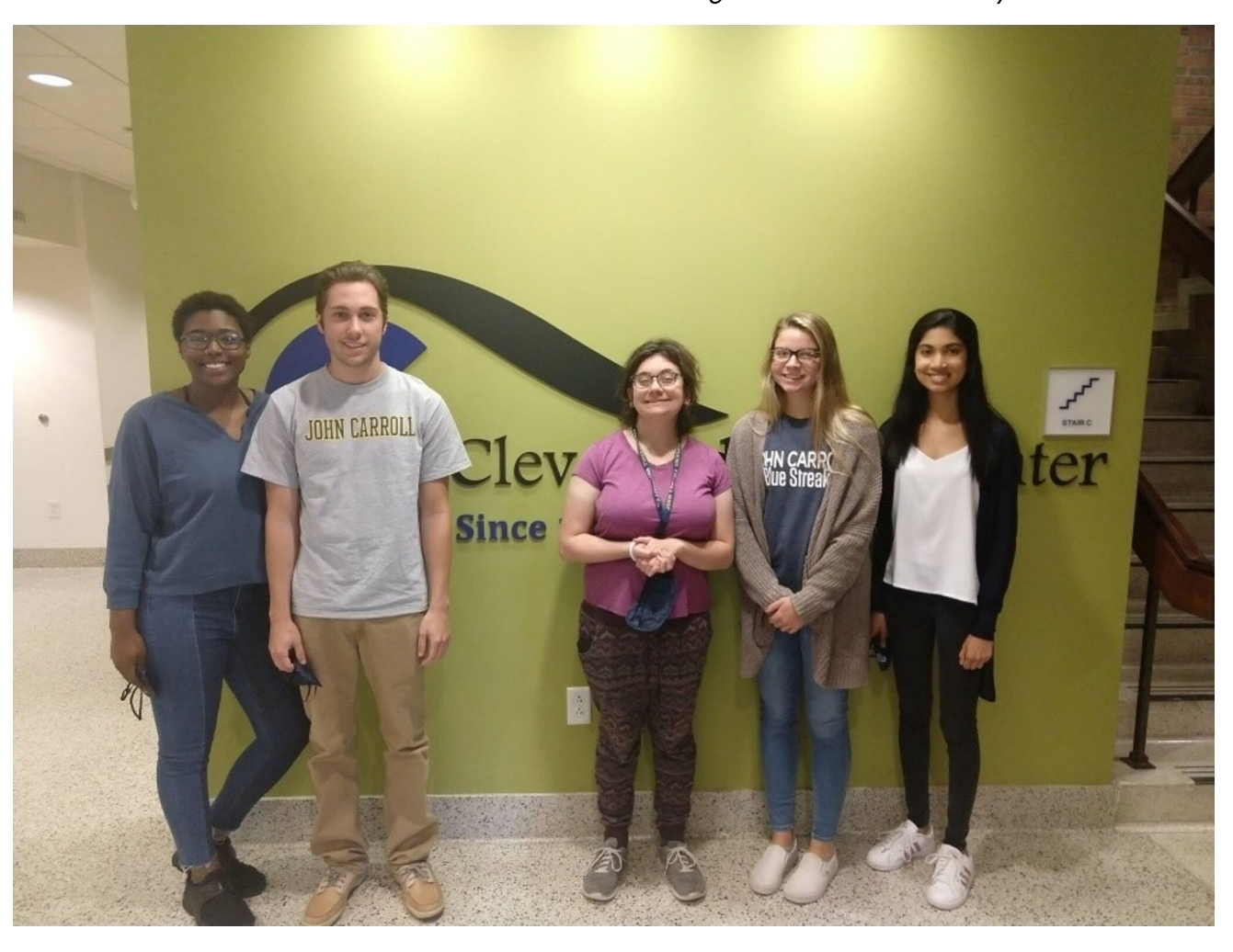
New volunteers in front of the lobby sign