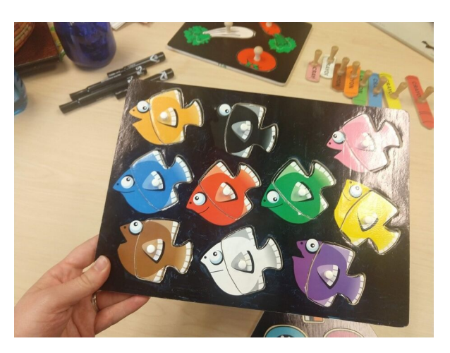
A completed accessible puzzle with a black background and fish in many colors